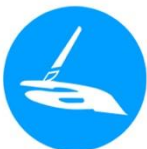
VINYL LETTERING & LOGOS